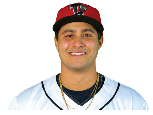
4-seam fastball, 2-seam fastball, slider, sweeper, change-up

Minor League Path: Made pro debut in the Arizona Complex League in 2022 with a pair of scoreless innings, moving up to Stockton for two relief appearances by year's end... spent all of 2023 with the Ports, serving as their relief ace (11 saves in 15 chances) and only allowing three home runs in 61 1/3 innings... limited left-handed batters to .198 batting average / .530 OPS; right-handers hit .305 with .753 OPS.