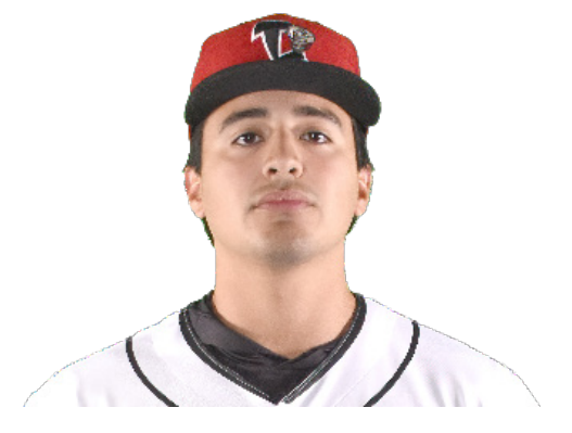
fastball, curve, change-up, slider

Bagels in April: Opened 2023 as the Ports' No. 4 starter, firing four scoreless innings at Fresno on April 11... that was the start of three consecutive scoreless outings to begin the year, finishing April with 13 2/3 scoreless innings... didn't allow first run until May 3 vs. Fresno, entering in relief in the fifth inning and allowing two runs in the fifth and two more in the seventh in a 5-4 Ports win... in total with Stockton, posted a 2.42 ERA with a .132 average against in five road starts (22 1/3 IP) compared to 4.24 ERA, .200 avg. in four home appearances (17 IP)... lefties hit .111/.243/.175 compared to righties' .205/.279/.308... base stealers went 2-for-2.