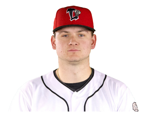
four-seam, two-seam, curve, change

Off to College: Did not receive much notice before his high velocity was discovered at a tryout in Morgantown... named to the Academic All-Big 12 Rookie Team as a freshman (5 G, 4.70 ERA, 7 2/3 IP, 4 R, 6 BB, 11 K)... as a sophomore, made 19 appearances: 3.33 ERA, 27 IP, 15 H, 11 R, 32 BB, bullpen-leading 53 K, .165 avg. allowed, tied for team lead with four saves; named Academic All-Big 12 Second Team; NCBWA Stopper of the Year Midseason Watch List... made first college start in the 2021 Big 12 Championship vs. Texas: 3 IP, 0 H, 1 R, 4 BB, 8 K... as a junior in 2022, named preseason All-American; dominated early as team closer and was moved into role as Friday starter; struck out 15 Texas Longhorns in 6 1/3 IP on May 7; overall: 18 G, 11 GS, 3-7, 6.22 ERA, 59 1/3 IP, 64 H, 44 R, 41 BB, 75 K; named All-Big 12 Honorable Mention.