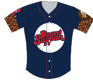
Bean Suppahs 1-0