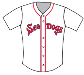
Home White 8-11