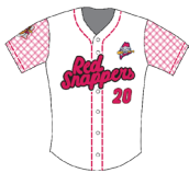
Red Snappers 1-0