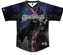
Star Wars 1-0