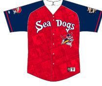
Whoopie Pies 1-0