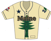
Maine Strong 1-0