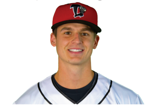
4-seam fastball, curve, sweeper, change

International Stage: With lowa, took part in the 2017 World University Games in Taipei City, winning a silver medal (fell to Japan in the gold medal contest)... part of the first American team to ever advance to the gold medal game as well as the first American team to ever medal, period... team finished 5-2, losing only to Japan... started five games, four at first base, one at pitcher.