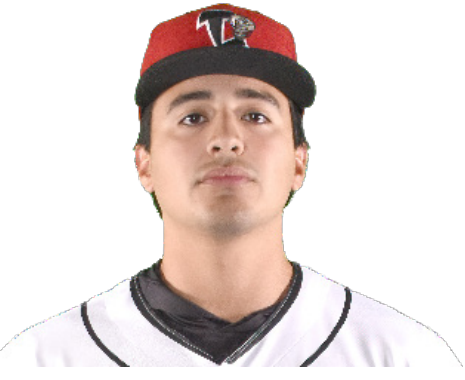
fastball, curve, change-up, slider

Bagels in April: Opened 2023 as the Ports' No. 4 starter, firing four scoreless innings at Fresno on April 11... that was the start of three consecutive scoreless outings to begin the year, finishing April with 13 2/3 scoreless innings... didn't allow first run until May 3 vs. Fresno, entering in relief in the fifth inning and allowing two runs in the fifth and two more in the seventh in a 5-4 Ports win... in total with Stockton, posted a 2.42 ERA with a .132 average against in five road starts (22 1/3 IP) compared to 4.24 ERA, .200 avg. in four home appearances (17 IP)... lefties hit .111/.243/.175 compared to righties' .205/.279/.308... base stealers went 2-for-2.