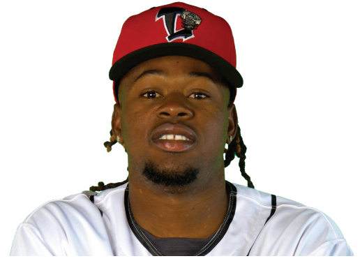
4-seam fastball, 2-seam fastball, slider, change-up

Twice Honored: Named the California League Pitcher of the Week on May 29-June 4 after tossing 7-inning, 1-hit gem vs. Modesto... named Pitcher of the Week again June 12-18 after tossing 7-inning, 2-hit gem at Lake Elsinore... from June 4-18, fired three consecutive seven-inning quality starts, allowing one total run on eight hits, seven walks, with 17 strikeouts.