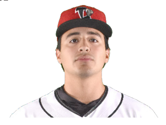
fastball, curve, change-up, slider

Bagels in April: Opened 2023 as the Ports' No. 4 starter, firing four scoreless innings at Fresno on April 11... that was the start of three consecutive scoreless outings to begin the year, finishing April with 13 2/3 scoreless innings... didn't allow first run until May 3 vs. Fresno, entering in relief in the fifth inning and allowing two runs in the fifth and two more in the seventh in a 5-4 Ports win... in total with Stockton, posted a 2.42 ERA with a .132 average against in five road starts (22 1/3 IP) compared to 4.24 ERA, .200 avg. in four home appearances (17 IP)... lefties hit .111/.243/.175 compared to righties' .205/.279/.308... base stealers went 2-for-2.