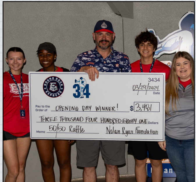
Our 2024 Opening Day winner with the 50/50 Raffle Team holding his winnings from the 50/50 Raffle.