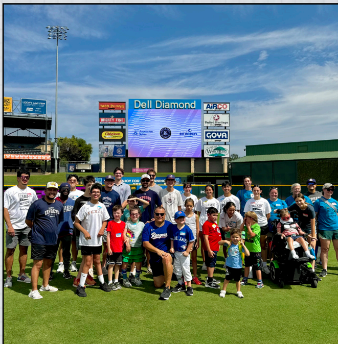
Express staff with Dell Children's Camp in Motion Campers after their morning clinic on September 14.