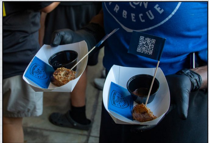
(Top) View of Express fans enjoying the Brisket Bash. (Bottom Left) Express fan smiling with her BBQ samples. (Bottom Right) Close up of boudin sausage from Brotherton's Black Iron Barbecue.