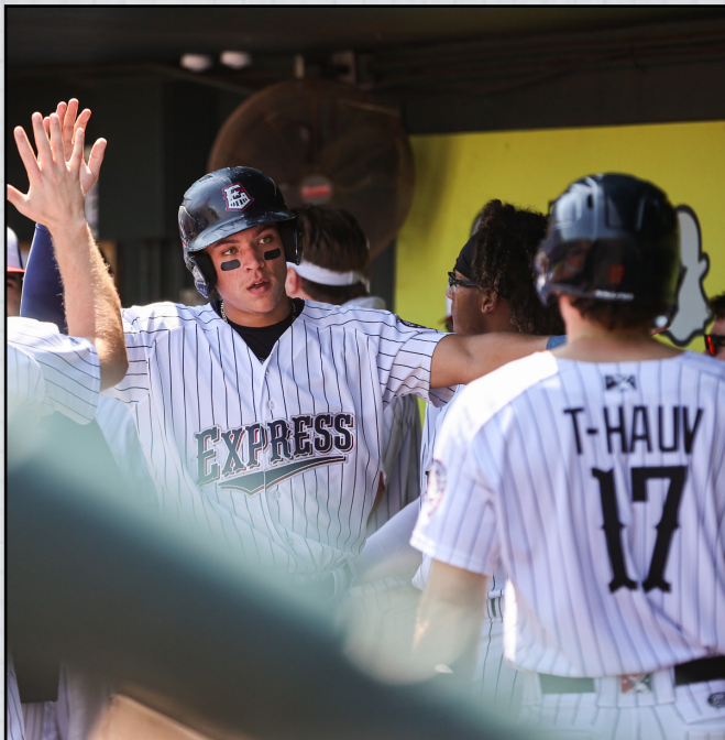
The Express auctioned off these pinstripe jerseys at the end of the season. Each jersey was pressed with a unique nickname chosen by each player & coach.