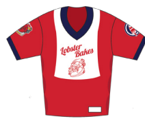
Maine Lobster Bakes