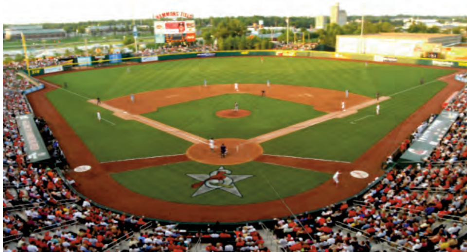
Directions to Hammons Field