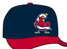
ALTERNATE 2 SUNDAY HOME GAMES