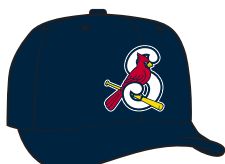
ROAD ALL ROAD GAMES