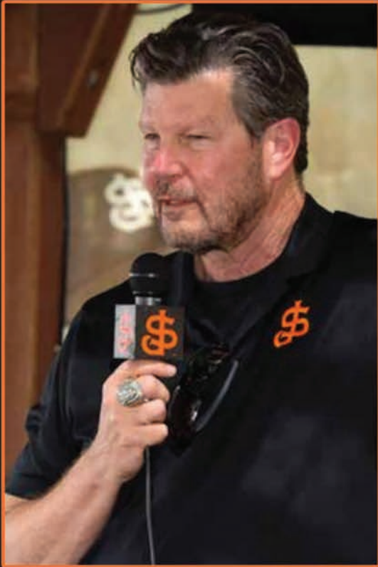
President and CEO San Jose Giants