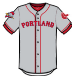
Road Grey 2-0