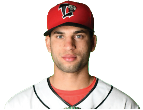
fastball, sweeper, change-up