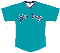
Throwback Teal 1-0