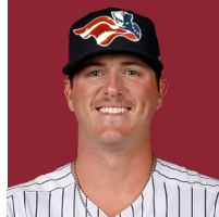
PROSPECT RANKINGS 2019 MLB Pipeline #29 Yankees Prospect