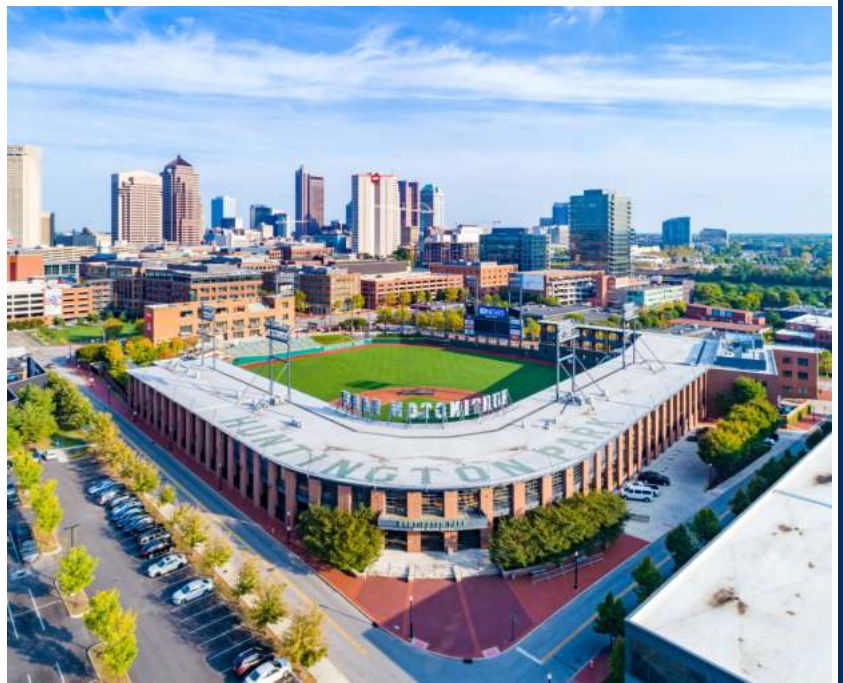
Huntington Park, the home of the Columbus Clippers