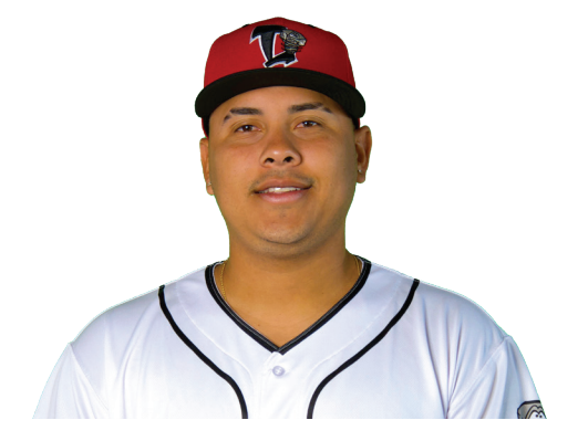
4-seam fastball, 2-seam fastball, cut fastball, slider, change-up