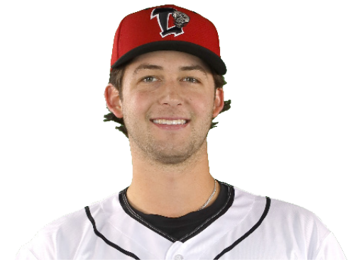
four-seam fastball, change-up, curve, slider

2023 with the Lugnuts: Opened season as the Nuts' Wednesday starter... tossed first quality start of the year on April 27, allowing two runs (both in the 5th) in six innings vs. Quad Cities April 27... followed up with a second quality start on May 4 vs. Dayton, though he once again received a nodecision... struck on the back of the head by a line drive against Peoria on June 13 and spent two weeks on the Injured List, missing his scheduled start at Wisconsin before returning to action at Great Lakes on July 3... tossed another quality start (6 IP, 4 H, 1 R, 0 BB, 6 K) against Quad Cities on July 27... 5.90 ERA / 1.77 WHIP / .318 avg. in home games (11 GS, 50 1/3 IP) compared to 3.71 / 1.29 / .244 avg. in road games (8 G, 6 GS, 34 IP).