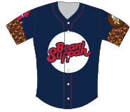
Bean Suppahs 1-0