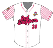
Red Snappers 1-0