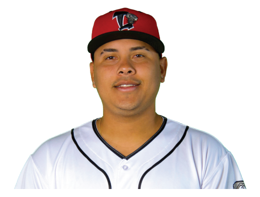
4-seam fastball, 2-seam fastball, cut fastball, slider, change-up