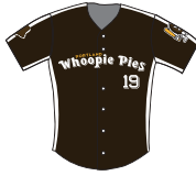
Whoopie Pies 1-0