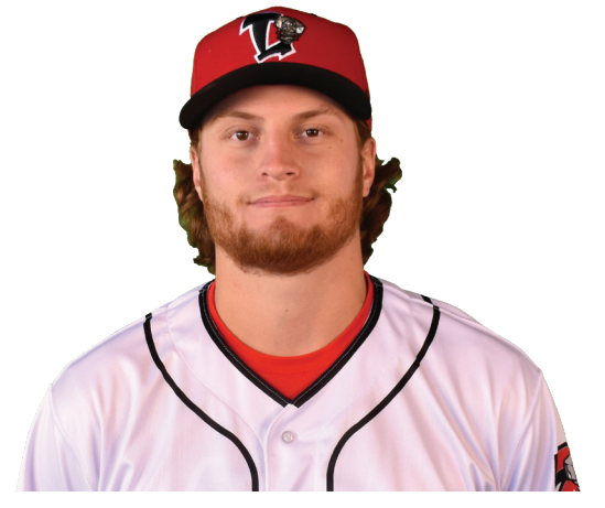
fastball, slider, change-up