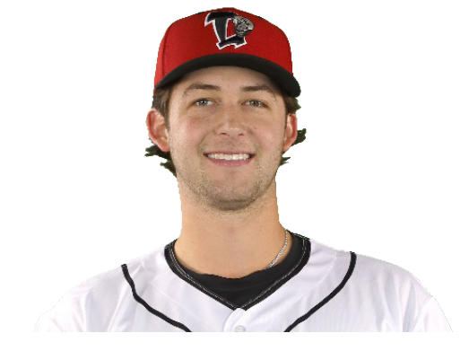
four-seam fastball, change-up, curve, slider

2022 Professional Debut: After signing for $125,000 as the Athletics' 12th-round selection in 2021, did not appear in a Minor League game until 2022, spent entirely with Stockton... led Ports in starts (22, six more than the closest teammate), innings (124 1/3, 28 1/3 more innings than the closest teammate), and double plays (10)... worked seven innings five times, 6 2/3 innings once, 6 1/3 innings twice, and six innings four times: 12 starts of 22 starts lasting at least six innings... struggled in 12 games, 11 starts, at home (7.11 ERA, .304 avg, 16 HR, in 57 innings) compared to 11 starts on the road (4.14 ERA, .269, 10 HR in 67 1/3 innings)... lefties and righties hit nearly identically: .286/.355/.536 for lefties, .285/.339/.525 for righties, though righties hit 17 of the 26 home runs allowed... struggled mightily in first innings, allowing .353/.402/.627 slash line and six home runs... opposing base stealers swiped 10 bases in 16 attempts.