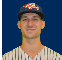
PROSPECT RANKINGS 2022 MLB Pipeline No. 29 Yankees Prospect