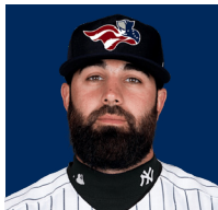
AWARDS / HONORS 2016 PCL Mid-Season All-Star