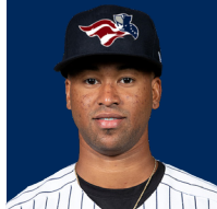
AWARDS / HONORS 2019 NYPL Pitcher of the Week: 8/18/19